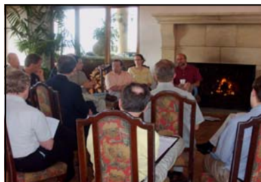
HP meeting at Sea Island, Georgia

In 2007-2008, CSRS, in collaboration with the Notre Dame Institute for Scholarship in the Liberal Arts, with support from the Provost's Office and the