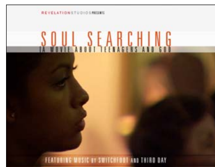
Soul Searching: A Movie About Teenagers and God is a documentary based on NSYR Wave 1 findings. www.soulsearchingmovie.com/portfolio/all/1.html

This third wave will seek to understand the religious and spiritual lives of emerging adults, who will be between 18 to 24 years of age at the time of data collection.