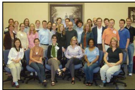
Young Scholars Conference Participants

The purpose of the conference was to bring together